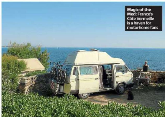
Magic of the Med: France's Côte Vermeille is a haven for motorhome fans