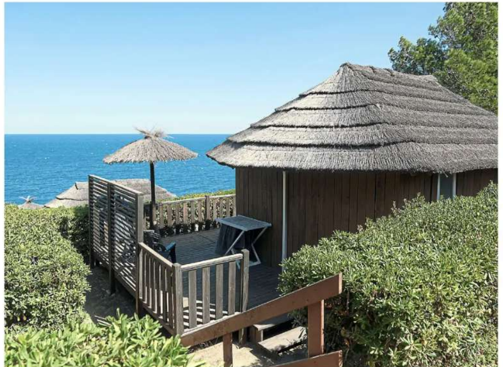
What a view: Seafront cabin with covered terrace at Les Criques de Porteils

I wake at 7am, sip my tea outside watching cyclists and joggers pass my cabin, and then I stroll to the on-site