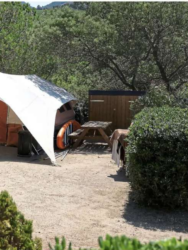
Paddleboard and picnic: A wooded, sandy spot is perfect for pitching your tent when you visit Argelès-sur-Mer