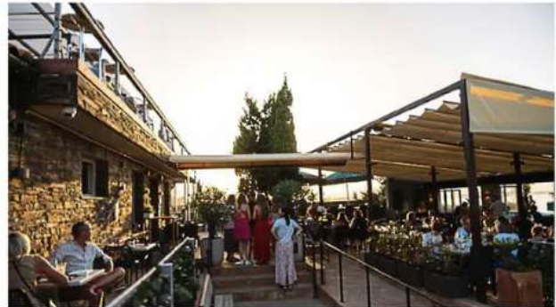
Dine in style: Les Criques de Portels restaurant offers alfresco dining, fresh seafood and a roof terrace with beautiful sea views

L'Imprévu. This bohemian beach bar, built above a creek overlooking the sea and rocks in Collioure, is a ten-minute walk from the campsite. Again expect plenty of seafood and fresh dishes.